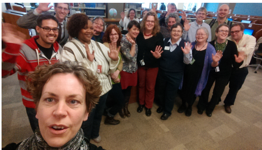
Library Staff Selfie

In this Issue: Summer Hours RefWorks World Labyrinth Day INFS 115: Information Access